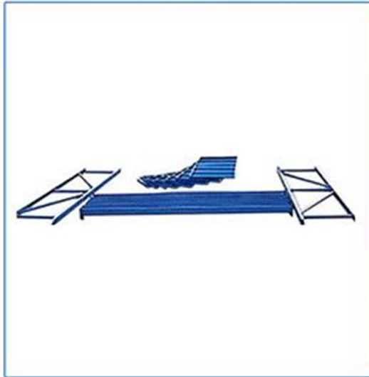
1. Check all accessories