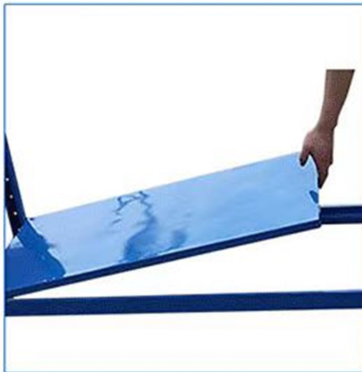
4. Install shelf on one side