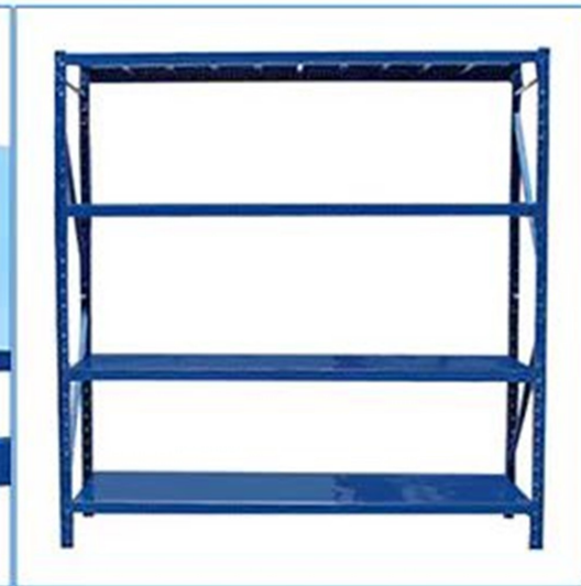
6. Install all shelves following the previous step