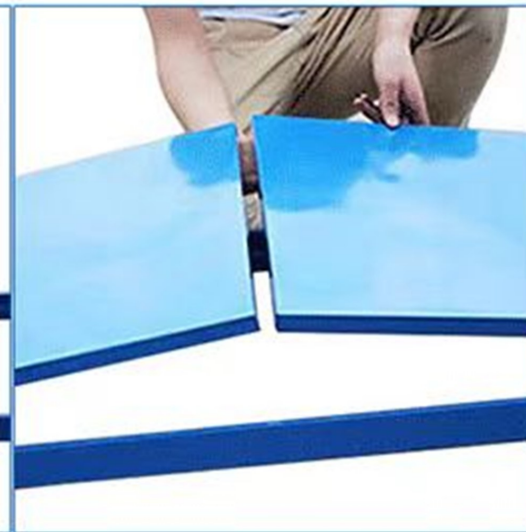
5. Each layer has two shelves, aligned in the middle and installed downward together