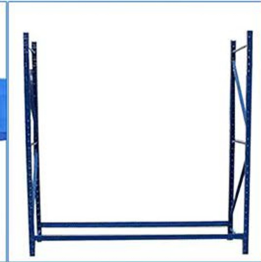
3. Install one side of the beam first, then install the other side of the beam